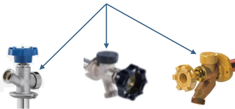
Screw on Hose Bib Vacuum Breakers are not needed on these styles.