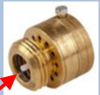
Vacuum Breaker NOT self-draining