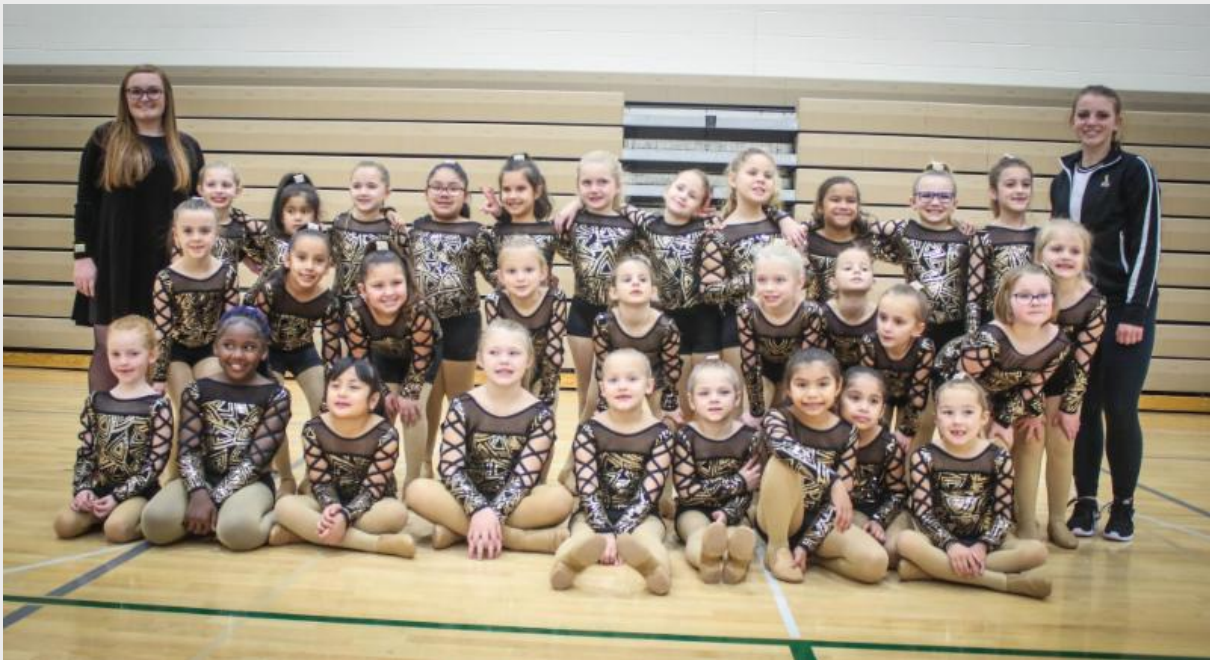
Lower Elementary - 2nd place in Hip-Hop

Congratulations to the Holland Township Recreation Competitive Dance Teams who competed in the Coopersville Dance Competition on December 1. The Middle School team took 2nd place in the Jazz category, the Upper Elementary School team took 1st place in the Jazz category and the Lower Elementary School team took 2nd place in the Hip-Hop category. Well done to the dancers and coaches! If you have any questions or would like additional information, please contact the Recreation Department .