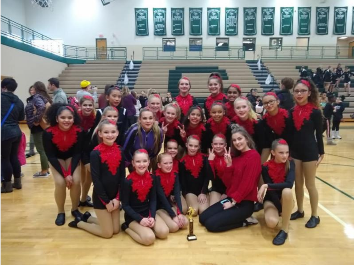
Middle School - 2nd place in Jazz