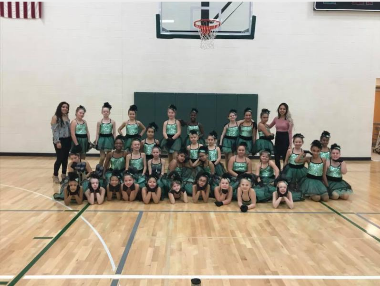
Upper Elementary School - 1st in Jazz